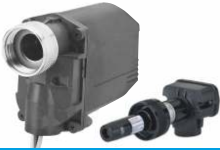
ADVANCED FLAME DETECTORS