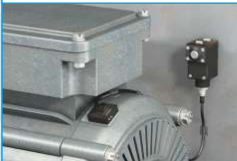
VIBRATION MONITORING SENSORS