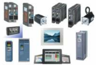
DRIVE, PLC, HMI