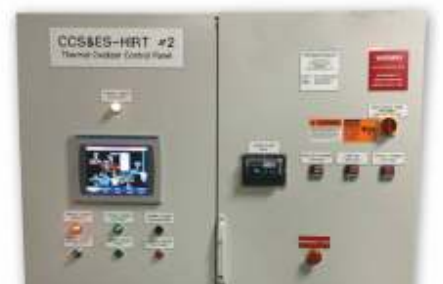
PLC CONTROL PANEL